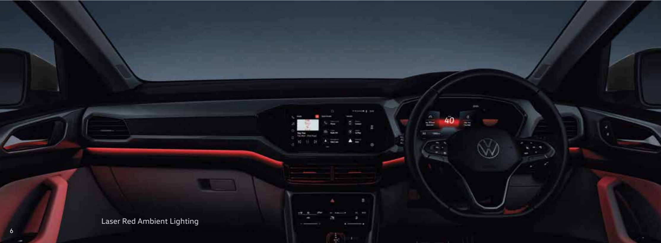
Laser Red Ambient Lighting