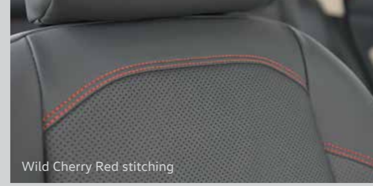
Wild Cherry Red stitching

The GT Edge collection extends its performance credentials to the interior as well. The dual-tone leather and leatherette combination seat upholstery with Wild Cherry Red stitching gives the interior a premium and performance-oriented look. Alu pedals and Laser Red Ambient Lighting further accentuate the sporty interior theme of the Volkswagen GT Edge Limited Collection.