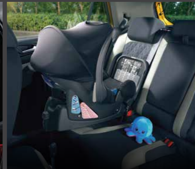
▲ ISOFIX child seat mount