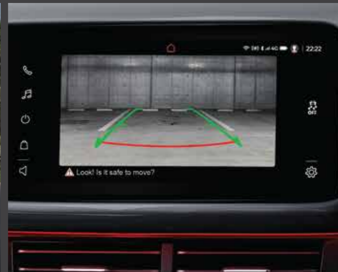
▲ Park distance control and rear-view camera